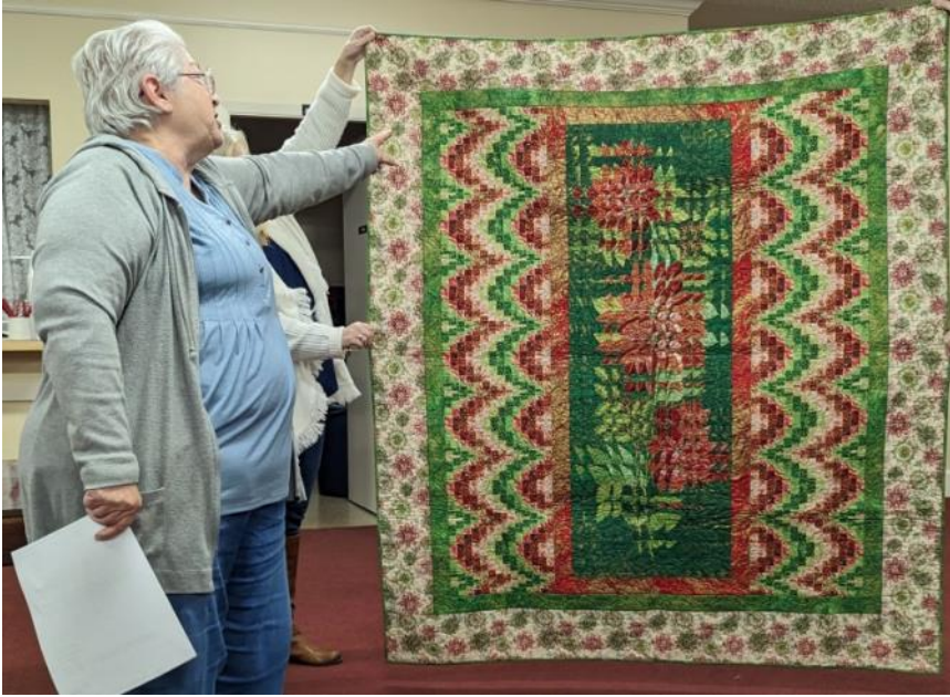
Fractured Poinsettias—panels & cheater bargello