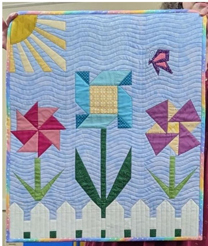
Patricia's quilt is White , Pinwheels , Swirls

Finished quilts will be shared as our program for our October 16 th meeting – our guild's birthday month.